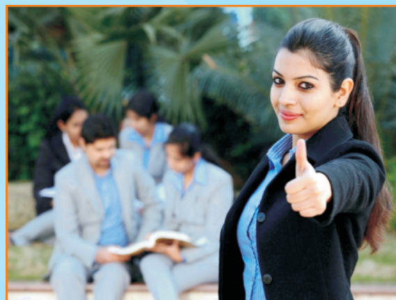
Fee Structure at a glance

Those students who possess their required qualification and want to appear at the SSC/Bank/Railway Exams can take admission in the course.